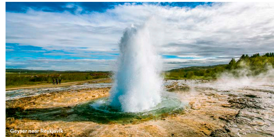
Geysir near Reykjavik