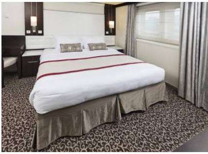
PS Two bedroom Suite. Size 35 m2. These 2-room suites are designed with a large double bed or two twin beds, an elegant living room, large private bathroom and windows. Located on Deck 5.