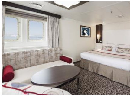
A Panorama Window Suite. Size 19-24 m2. Featuring a double bed or two single beds, a relaxing sitting area, private bathroom and windows. Located on Deck 5.