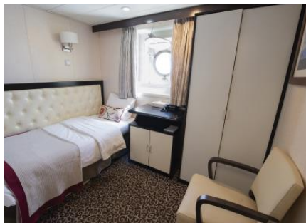
G Outside single Cabin. Size 9-10 m2. Cabins feature a single bed, private bathroom, and a porthole. Located on Deck 4.