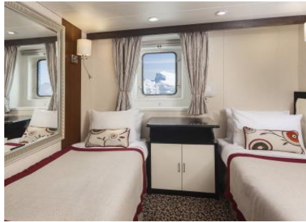
C Window Cabin. Size 12-13 m2. This Standard Cabin has two single beds, private bathroom, and a window. Located on Deck 5.