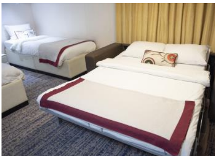
F Inside Triple Cabin. Size 18-21 m2. Cabin featuring a double or two single beds, and a fold-out single bed, a relaxing sitting area, and a bathroom with a bathtub. Located on Deck 5.