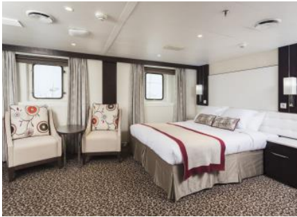
B Panorama Window Suite. Size 20-23 m2. Featuring a double bed or two single beds, a sofa bed that enables triple accommodation, a relaxing sitting area, private bathroom and windows. Partly obstructed view. Located on Deck 7 & 8.