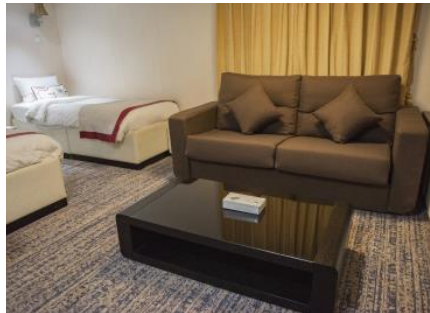
E Inside Cabin. Size 18-21 m2. Large Inside Cabin, featuring a double or two single beds, a relaxing sitting area, and a bathroom with a bathtub. Located on Deck 5.