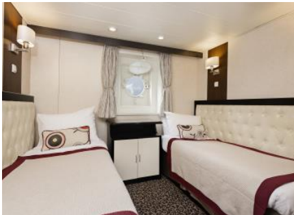
D Porthole Cabin. Size 11-12 m2. Featuring two single beds, private bathroom, and a porthole. Located on Deck 4.