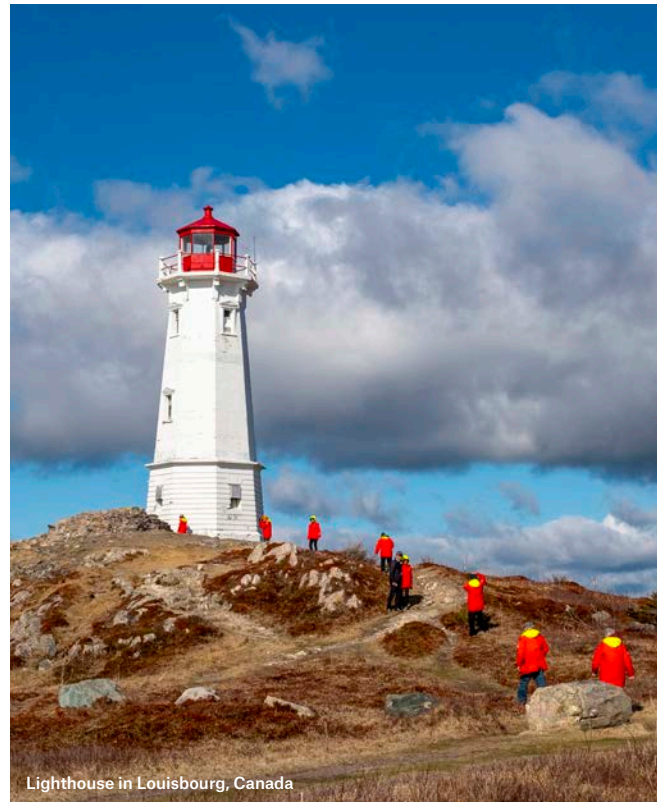
Lighthouse in Louisbourg, Canada

Explore powerful natural beauty and learn about colonial, Viking, and Inuit culture on this expedition cruise to Canada's Maritime Provinces and Greenland.